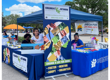
Safe Kids Day

We joined our partner Adoption-Share for March Matching Madness . In this friendly competition, adoption teams across the state of Florida competed to match waiting children with waiting families!