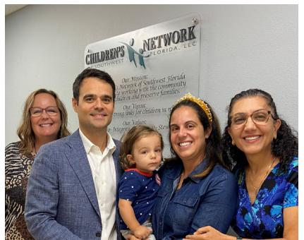
Light Foundation Gala

The Children's Light Foundation and many wonderful donors came together at the First Annual Children's Light Foundation Gala to support enrichment activities for children in foster care. The love and generosity demonstrated for our kids is absolutely amazing. A grand total of $40,000 was raised at the Gala to help pay for activities such as summer camp, music lessons, sports, and other extra-curricular opportunities.