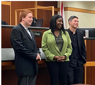
National Adoption Awareness Month